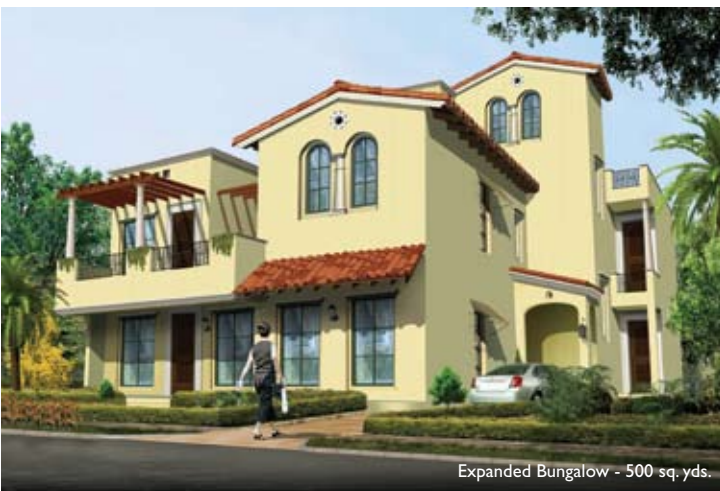
Expanded Bungalow - 500 sq. yds.