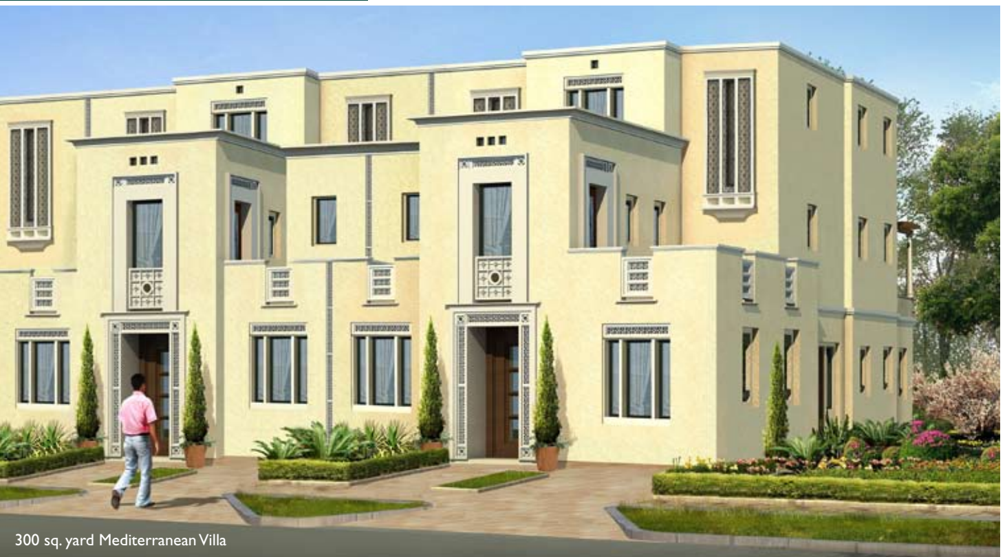
300 sq. yard Mediterranean Villa