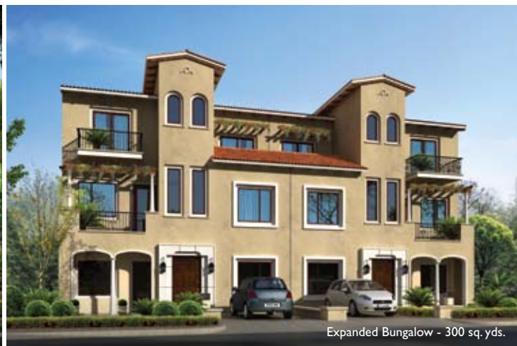
Expanded Bungalow - 300 sq. yds.