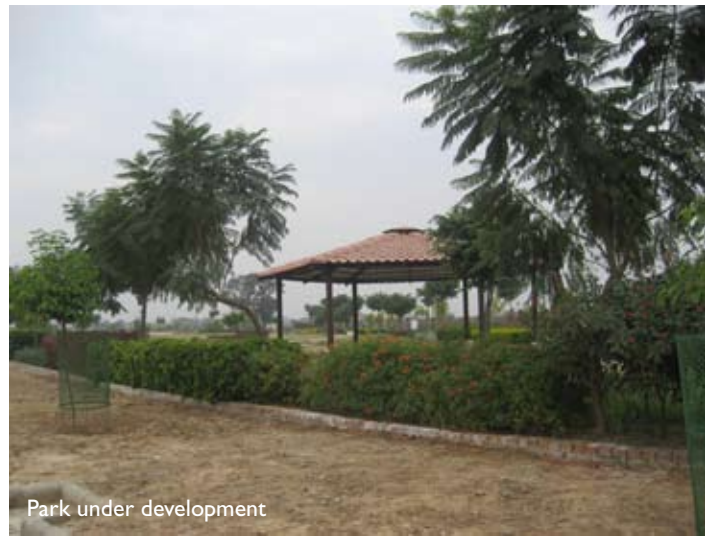
Park under development