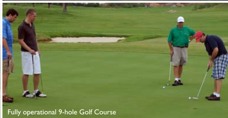
Fully operational 9-hole Golf Course