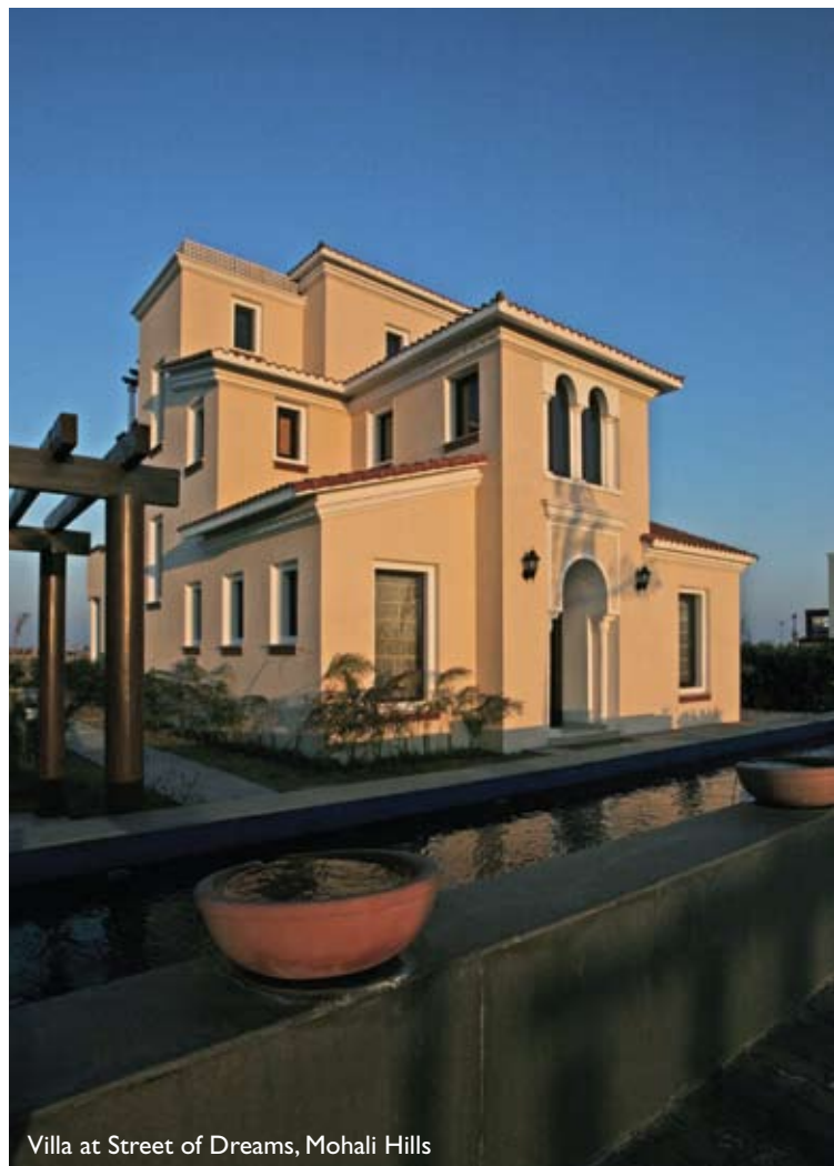
Villa at Street of Dreams, Mohali Hills